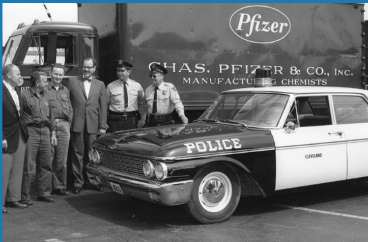
Cleveland Police provide escorts for Pfizer trucks that contained the polio vaccine.