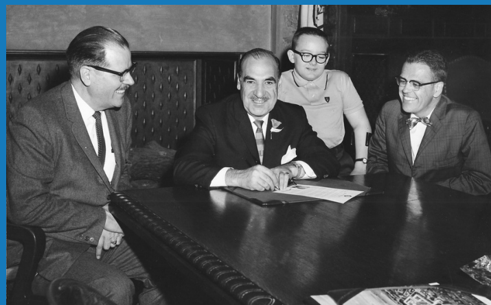
Mayor Celebrezze (center) awards the Academy a proclamation for the SOS program.