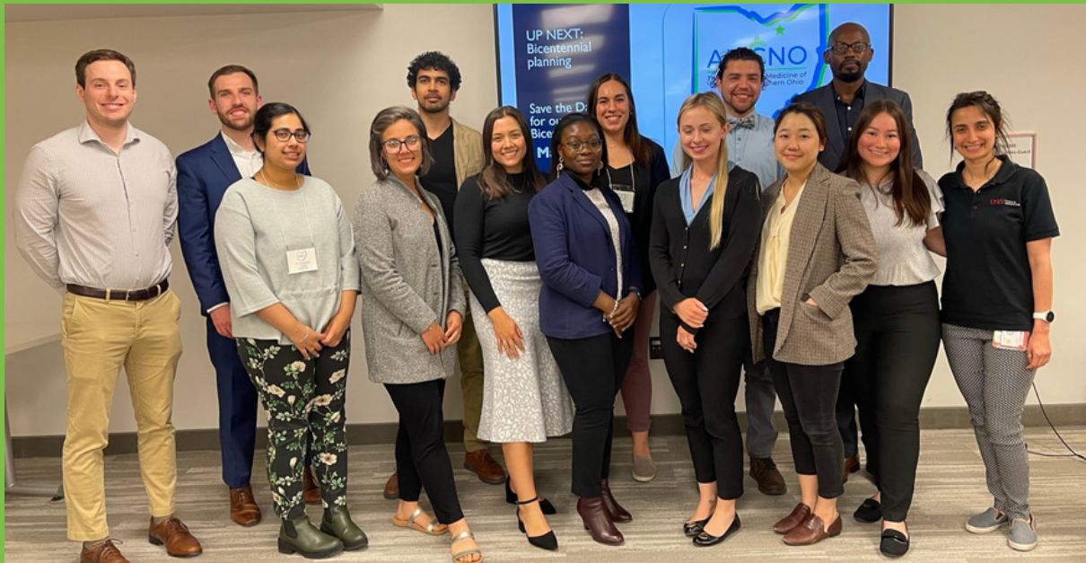
The new class of the Future Leaders Council at their orientation in May