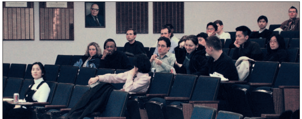
Case medical students listen to the presentation on medical liability issues.

MICRA legislation in California that included caps on noneconomic damages AND on attorney contingency fees." He added, "Everyone should ask how much of that $30 million decision is slated to go to the attorneys in that case? The answer is probably more than 40 percent. Bottom line, there should be a cap on these fees."