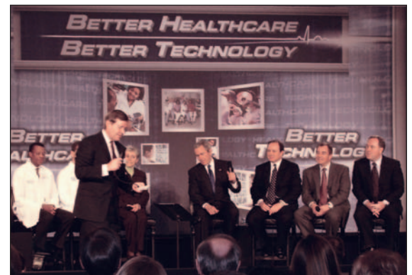
Secretary Michael Leavitt, the newly appointed Health and Human Services leader, introduces the President and the panel to the audience.

AMC/NOMA 6000 Rockside Woods Blvd. Ste. 150 Cleveland, OH 44131-0999