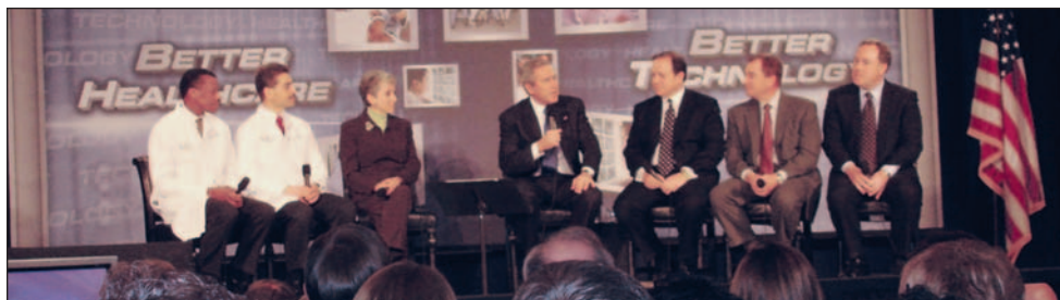
President Bush moderates the panel in a discussion about electronic medical records.