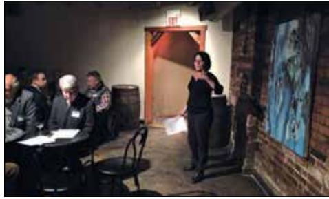
A wine expert provides detailed descriptions of the wine samples as they're presented.

Photos from the Wine Tasting can be found on the AMCNO Facebook page and Twitter feed. ■