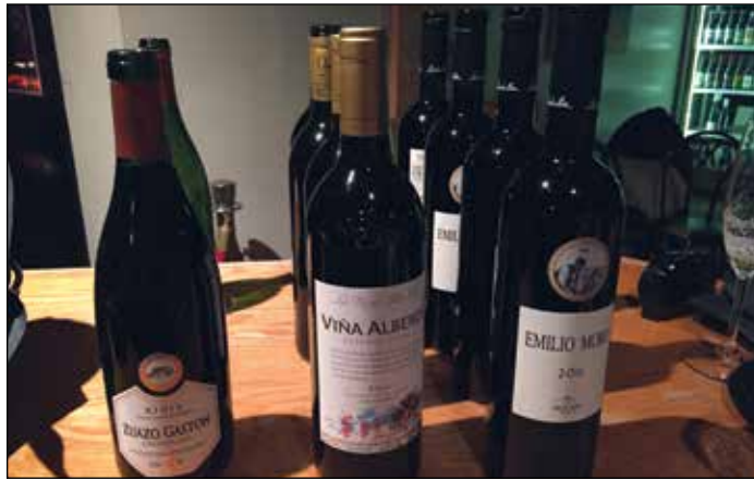
Six wines from various regions of Spain are featured for the evening.