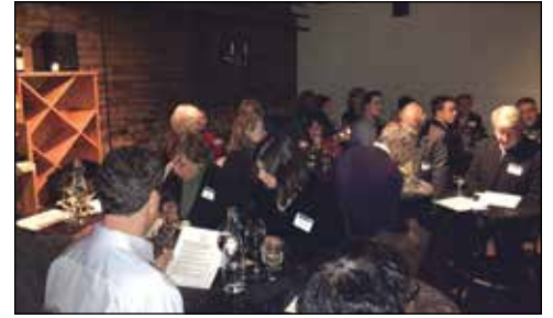
Members and their guests gather for the annual Wine Tasting event.