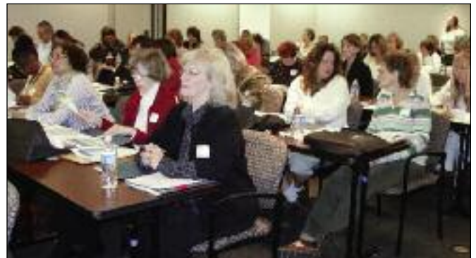
Attendees at the annual AMCNO seminar garnered important information from the presenters.