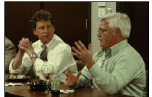
Mini-internship participants share their experiences during the debriefing dinner.