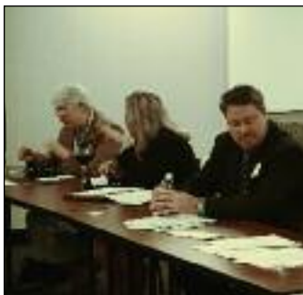
Participants share notes during the orientation.