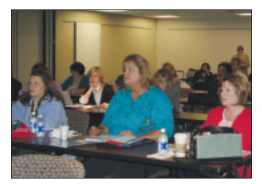
Practice managers from around the Northern Ohio region participated in the UnitedHealthcare Town Hall meeting at the AMCNO offices.

On May 18th, the AMCNO welcomed an audience of physicians and office managers to the UnitedHealthcare's Cleveland Town Hall Meeting. Various speakers discussed UnitedHealthcare's (UHC) newest programs and recent changes developed to help physician practices achieve greater efficiency and patient satisfaction.