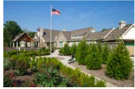
AMES FAMILY HOSPICE HOUSE WESTLAKE