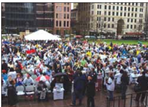
The AMCNO staff attended a rally that took place at the Ohio Statehouse recently where advocates for the Medicaid expansion urged Ohio lawmakers to support extending health care benefits through Medicaid.

Leaders in the Ohio House unveiled a budget plan that removed Governor John Kasich's proposal to expand Medicaid coverage to Ohioans making up to 138 percent of the federal poverty level which would have brought