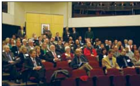
The Summit was very well attended by physicians, attorneys, hospital employees and administrators.