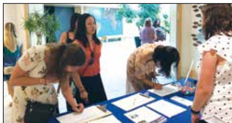
Medical students learn more about the AMCNO and sign up for free membership.