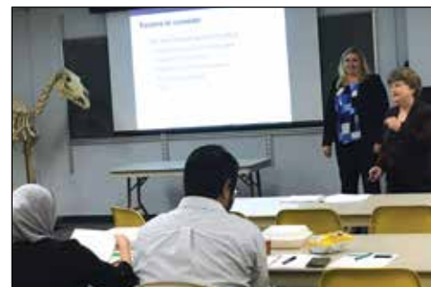
Representatives from Rea and Associates share solid financial information with the attendees.