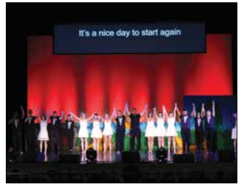
Students perform a musical number during the 2019 Doc Opera event, "The Wizard of Gauze."

Doc Opera is a non-profit organization that relies on area businesses to help defray the costs of production and to contribute to the donations made to the program's beneficiaries. The Academy of Medicine Education Foundation (AMEF) and the Academy of Medicine of Cleveland & Northern Ohio (AMCNO) are pleased to once again sponsor the Doc Opera event.